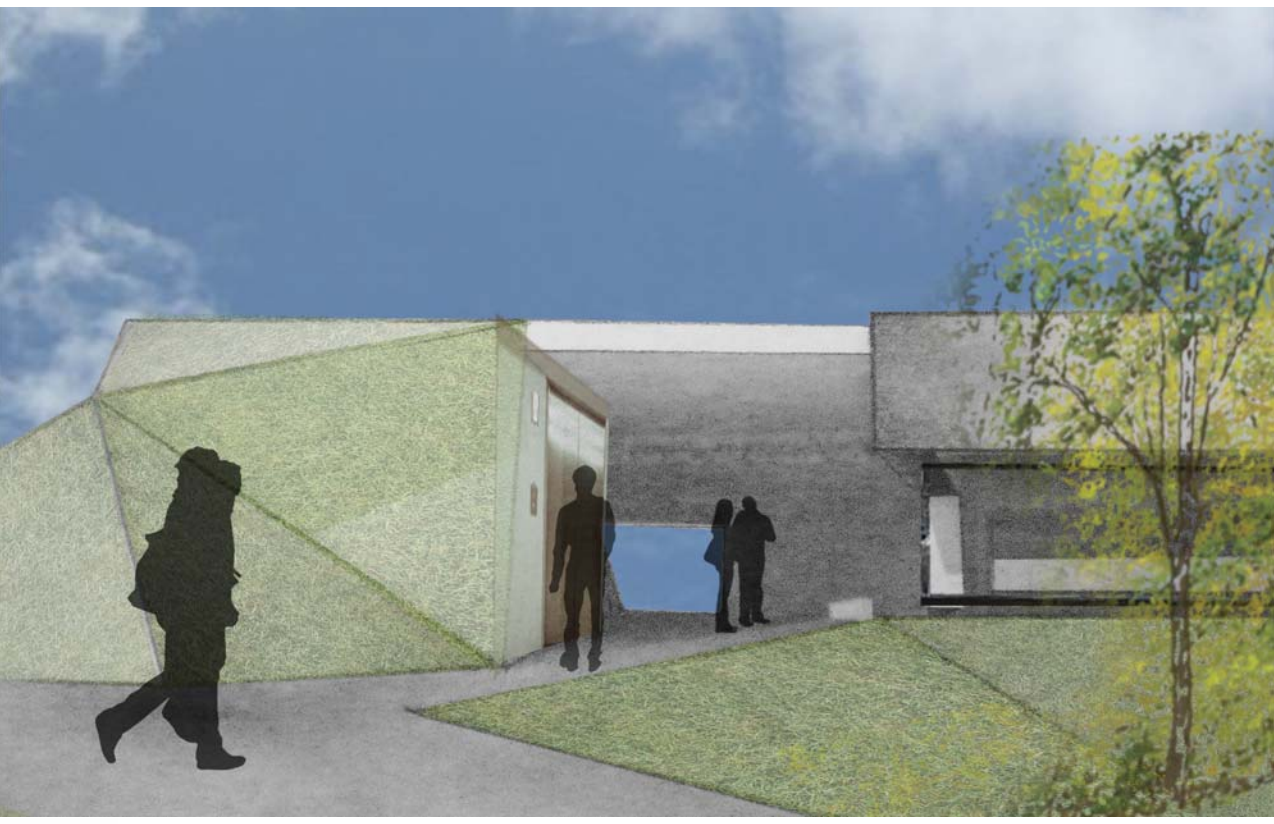
C - Roof Entrance Area