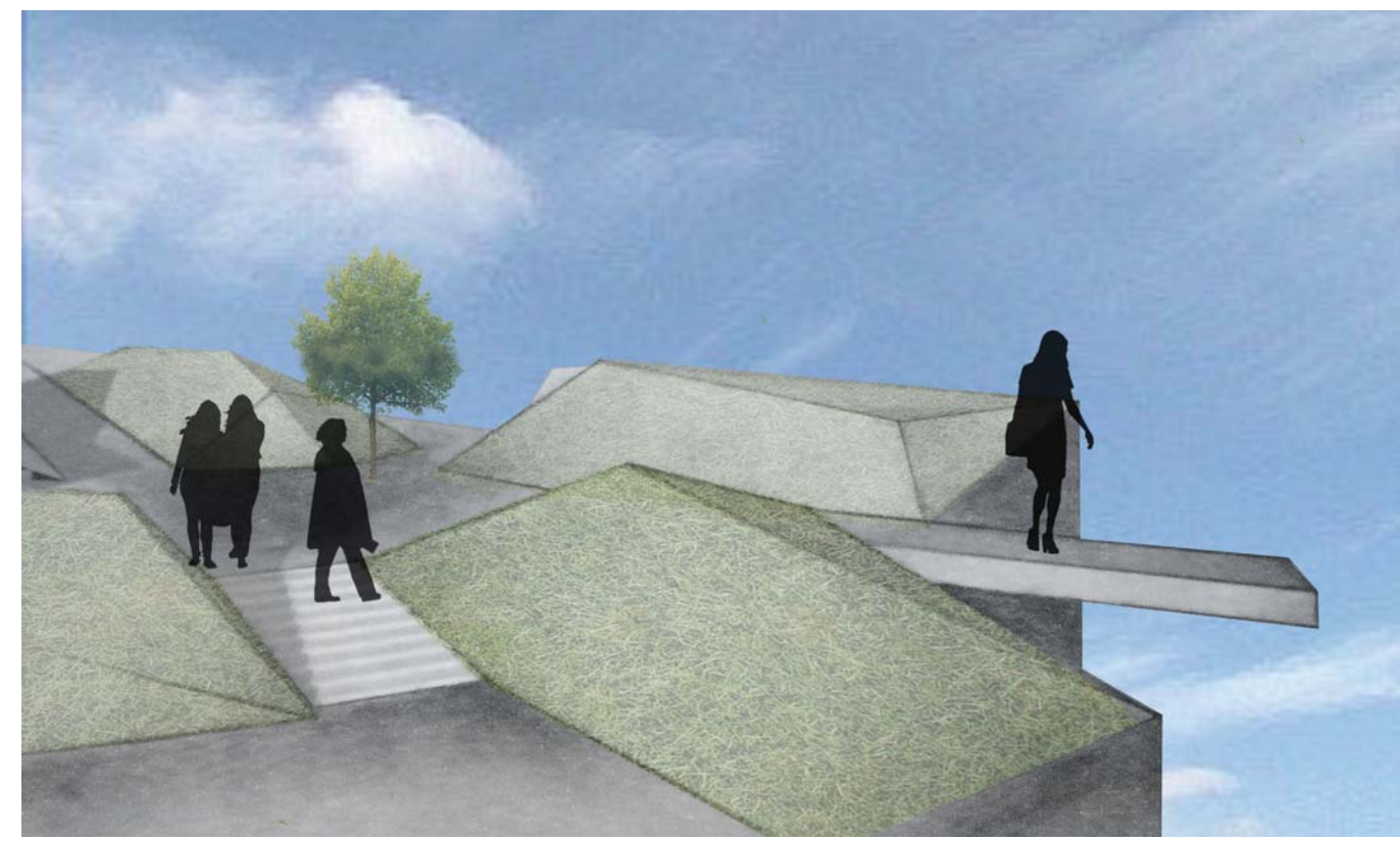
E - Path Overhang Area